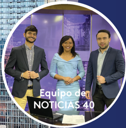
Equipo de NOTICIAS 40